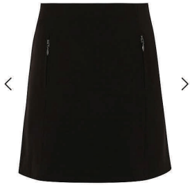
Girls Black Zip Detail A-Line School Skirt