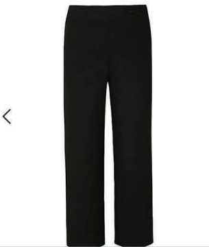
Girls Black Straight Leg School Trousers

Essential clothing for the school year, these are smart, practical trousers with a pretty, discreet bow detail at the waistband. Designed with an adjustable waist for an improved fit, this garment also includes a Teflon® finished to keep stains at bay.