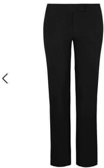
Black Formal Bootcut Trousers